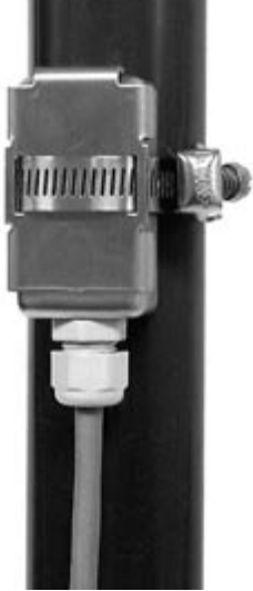
DFS-II Doppler Sensor with Pipe Clamp